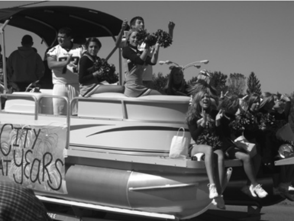
Floats from organizations from LBC as well as surrounding communities participated in the parade. This float featured the JV Football Team and Cheerleaders. All participants wanted to congratulate Lower Burrell on 50 years.